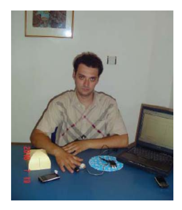
Figure 1. Measuring of the resistance on the skin of a person exposed to a Stojan's cosmic knot without protection